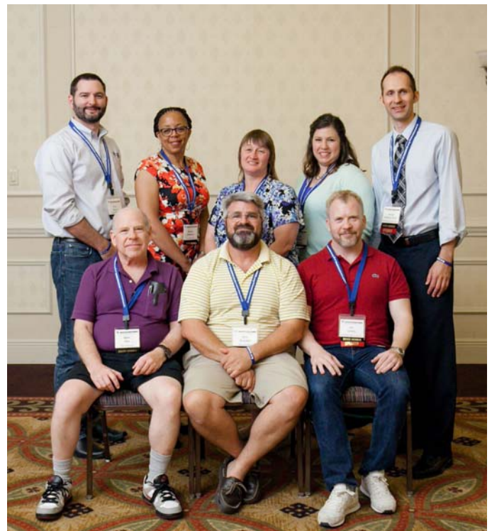
ANN Board Members at the 2015 Conference